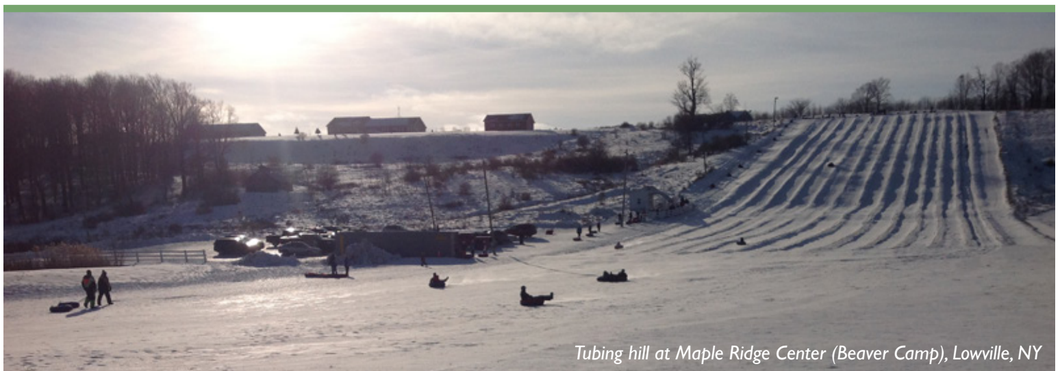
Tubing hill at Maple Ridge Center (Beaver Camp), Lowville, NY